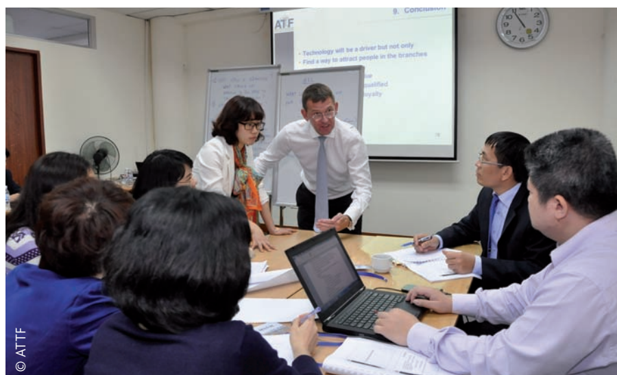
A practical training session in Vietnam

The work carried out by private sector experts on behalf of ATTF is a showcase for the know-how available in the financial centre. Long term, it has helped build up relationships with developing countries and brought business to the financial centre.